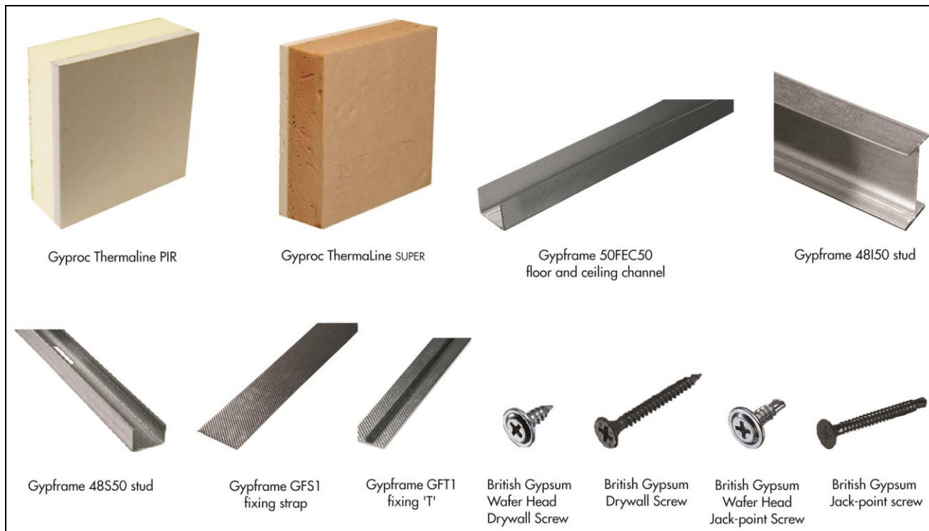
Figure 1 GypLyner IWL — system components

1.4 The boards are available with the nominal characteristics shown in Table 1.